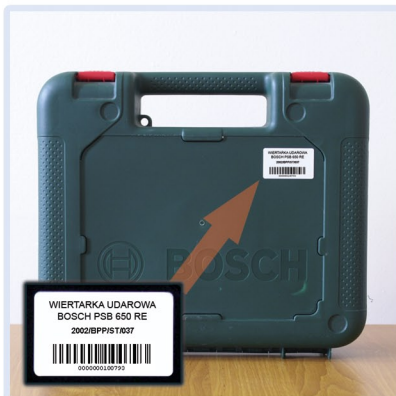
Marking with a barcode