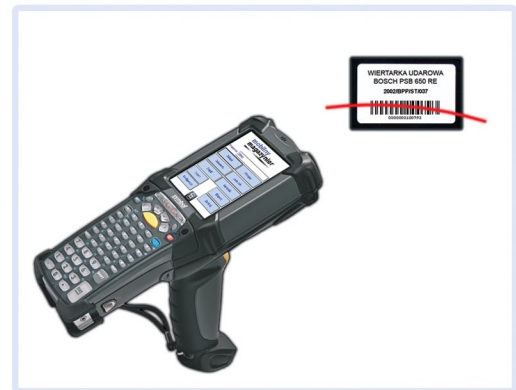
Quick issuance using the data collector and the program PWSK Mobile Tool Control