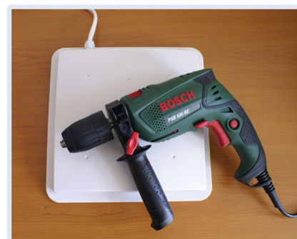
Checkouts of tools marked with hidden RFID tags